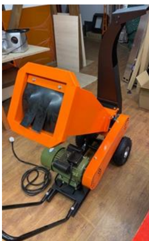
Fig. 4. Shredder driven with electric engine of 4 kW