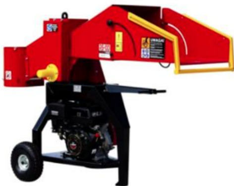
Fig. 1. Chopper driven with thermal engine of 6.5 CP