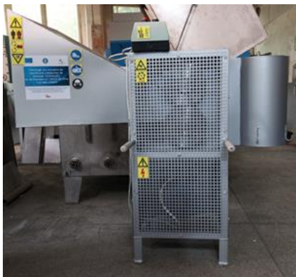
Fig. 3. Chopper driven with electric engine of 2.2 kW